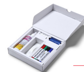
(STARTERKIT) STARTERKIT STARTPACKUNG