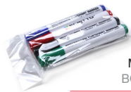
(SETFIXWB) MARKER PENS BOARDMARKER